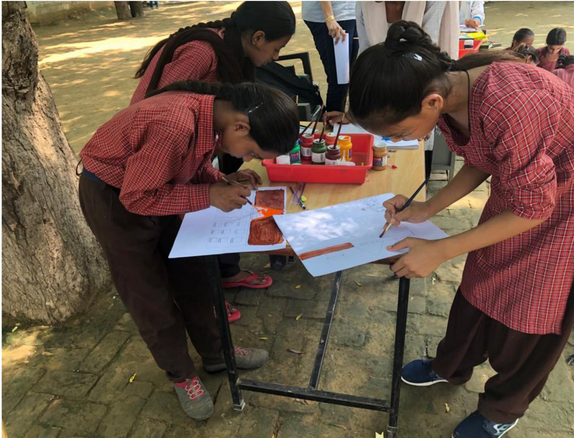
Government Girls School Village Mohna

Adoption of different government schools in rural areas of Faridabad and working on the development of school education and capacity building of children and other people.