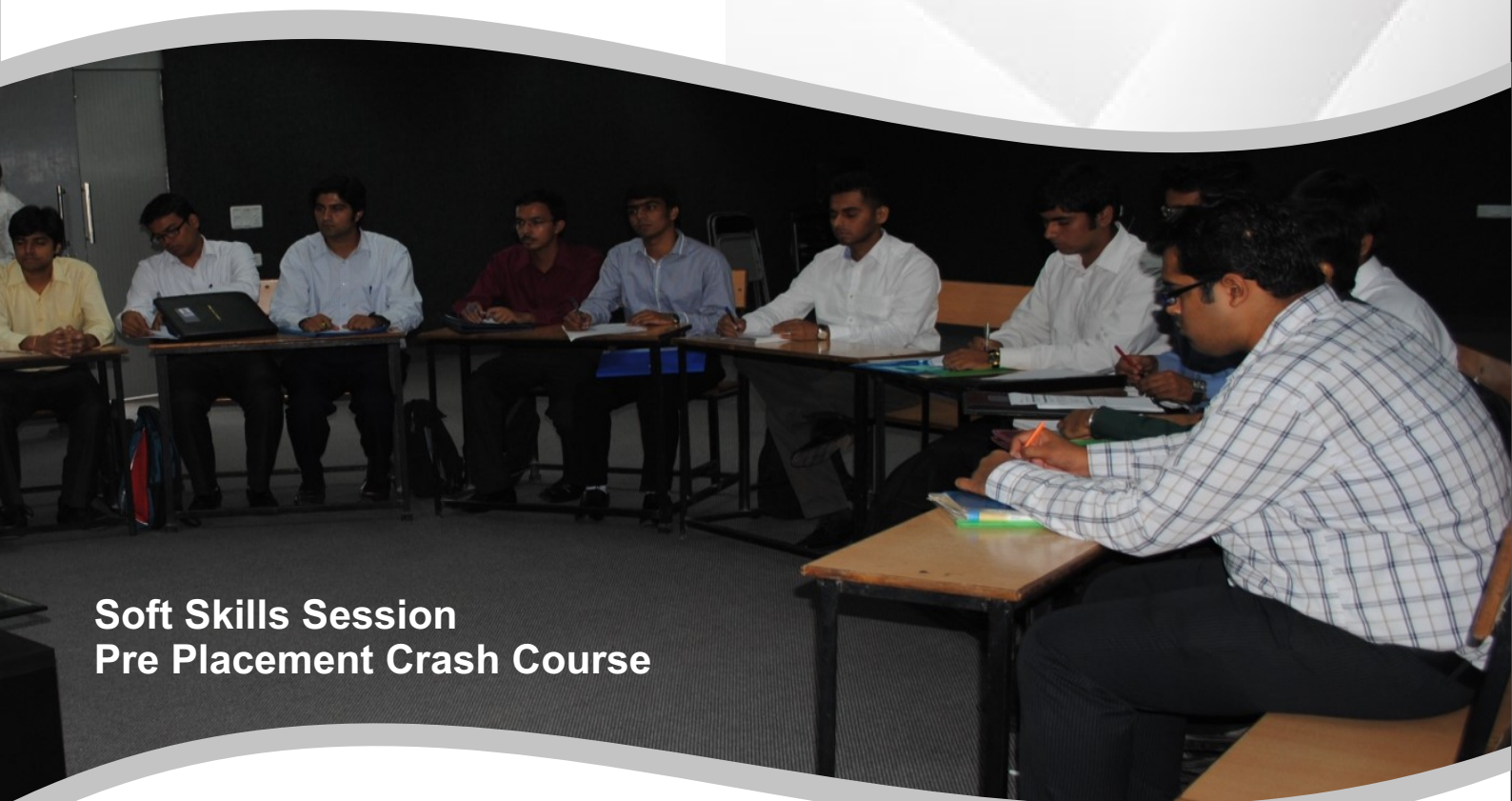
Soft Skills Session Pre Placement Crash Course