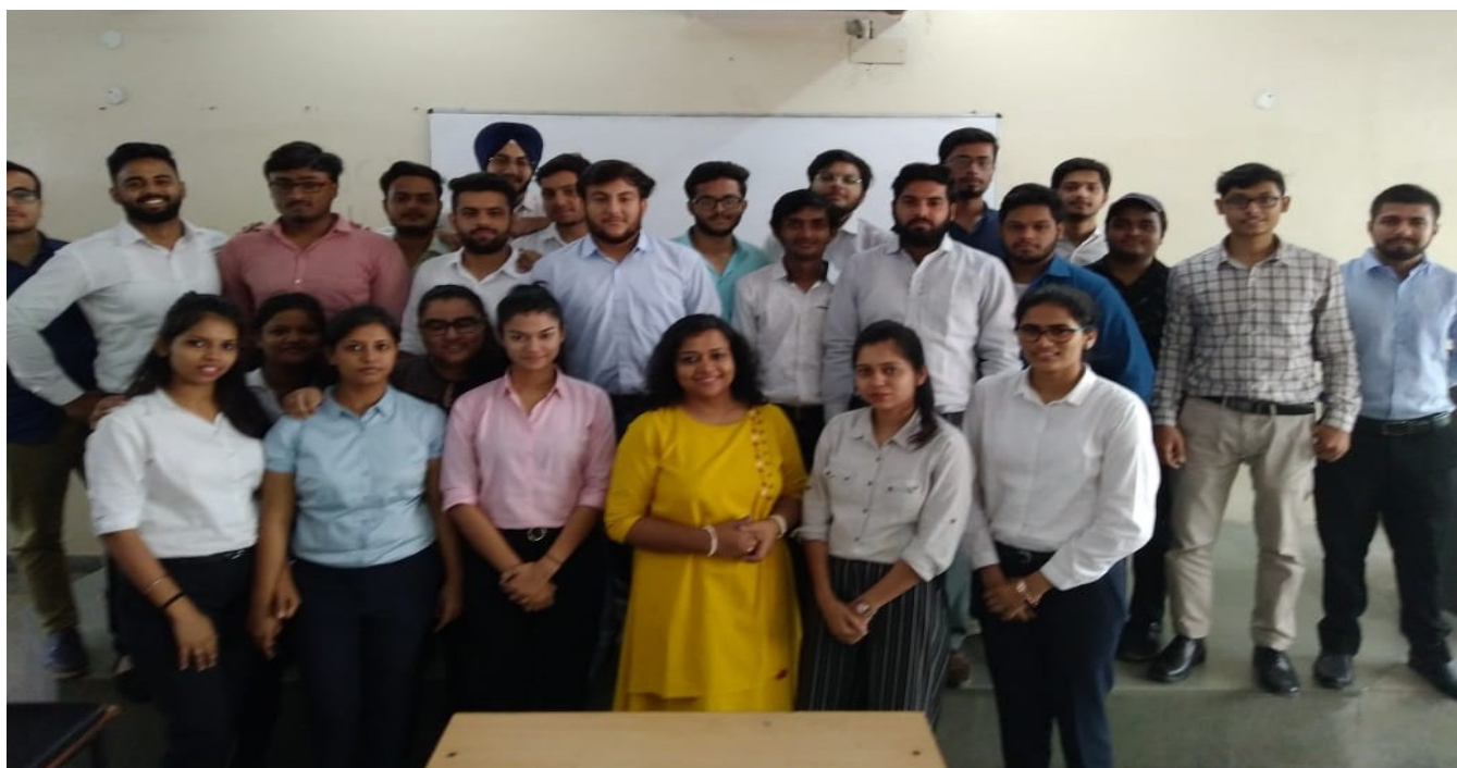
Preparation Session on HP Pool Campus