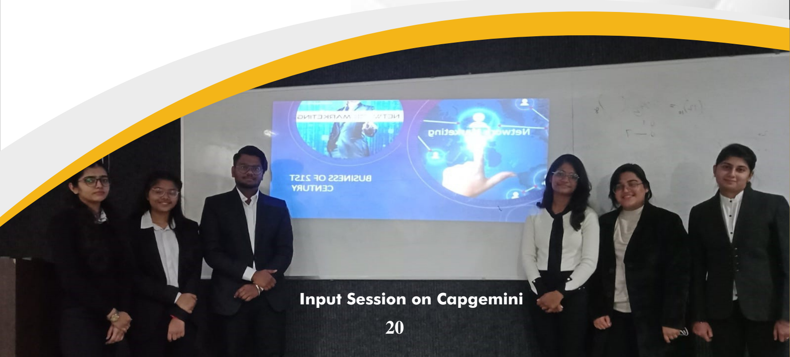
Input Session on Capgemini