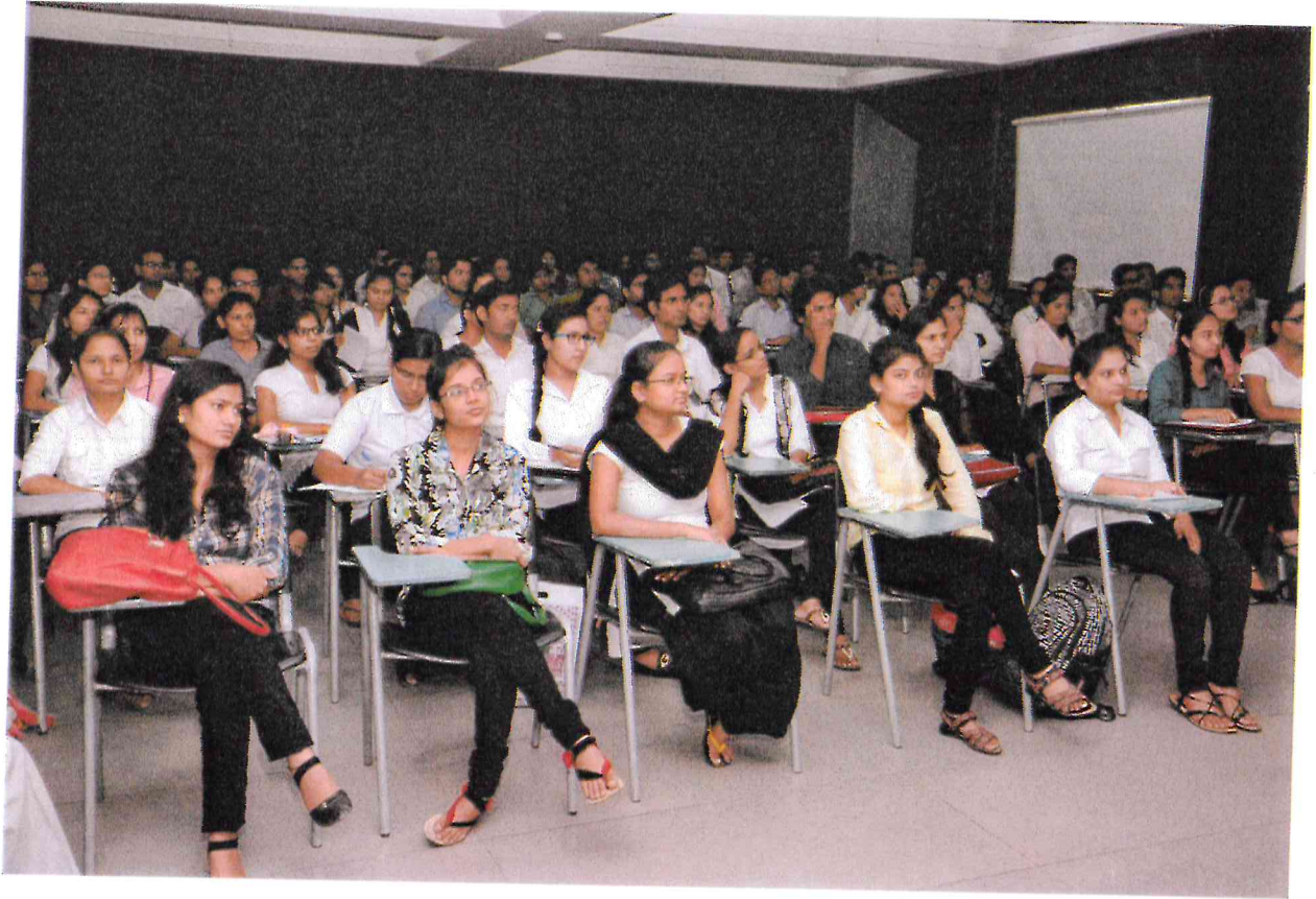
Aptitude Development Session for Career Breakthrough