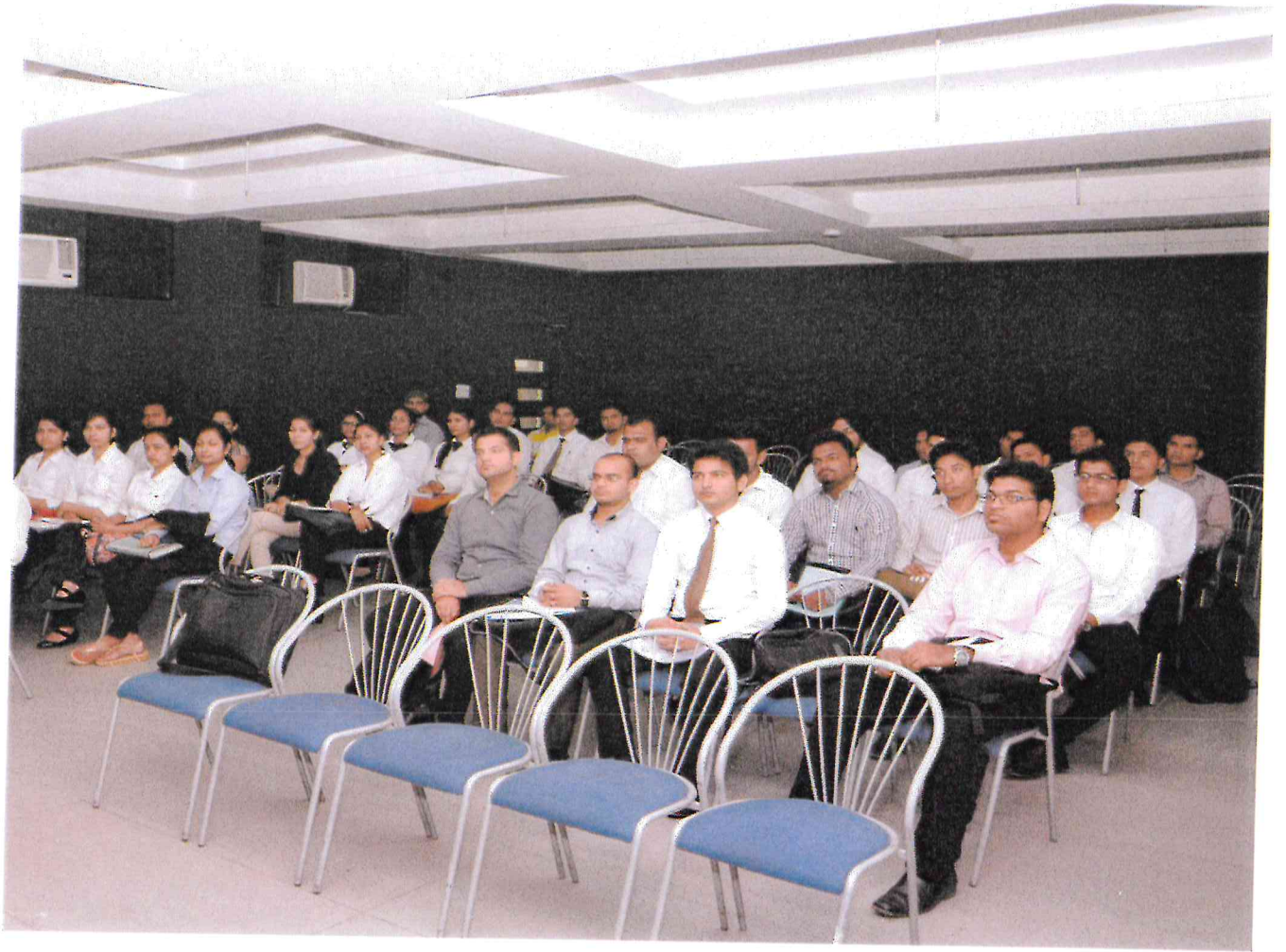
Training for IBM & NIIT