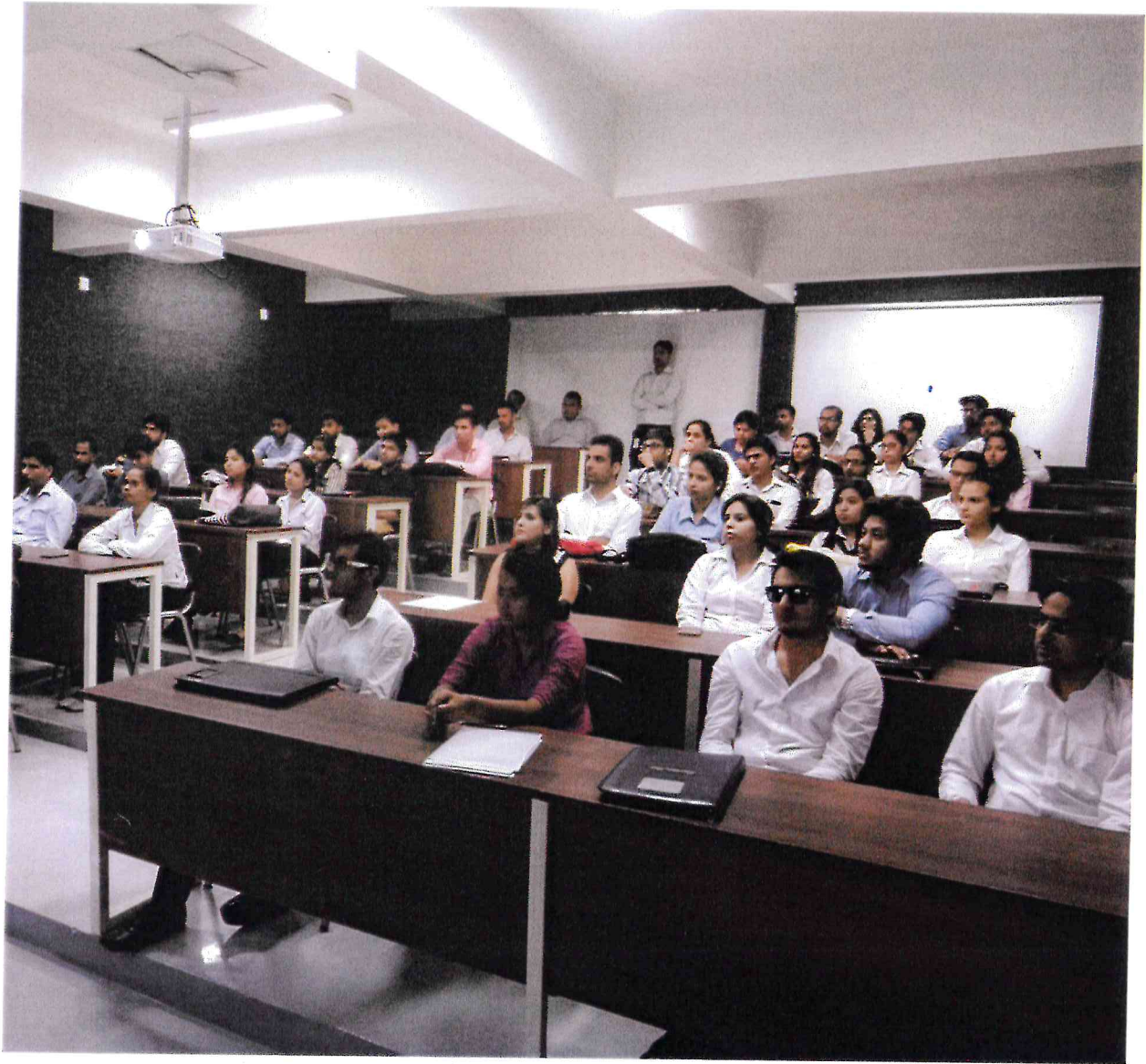
Employability Training on Soft Skills & Aptitude Development