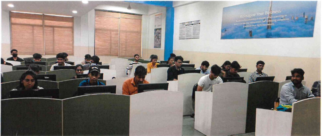
Language Lab – (2018-2019)