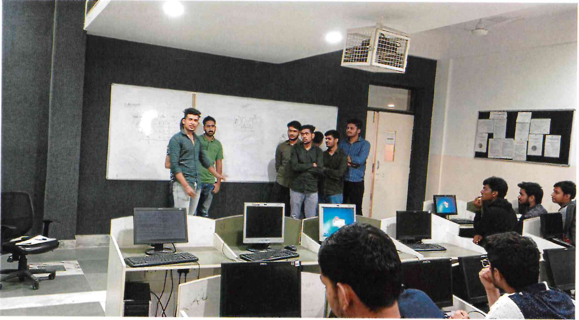
Language Lab – (2019-2020)