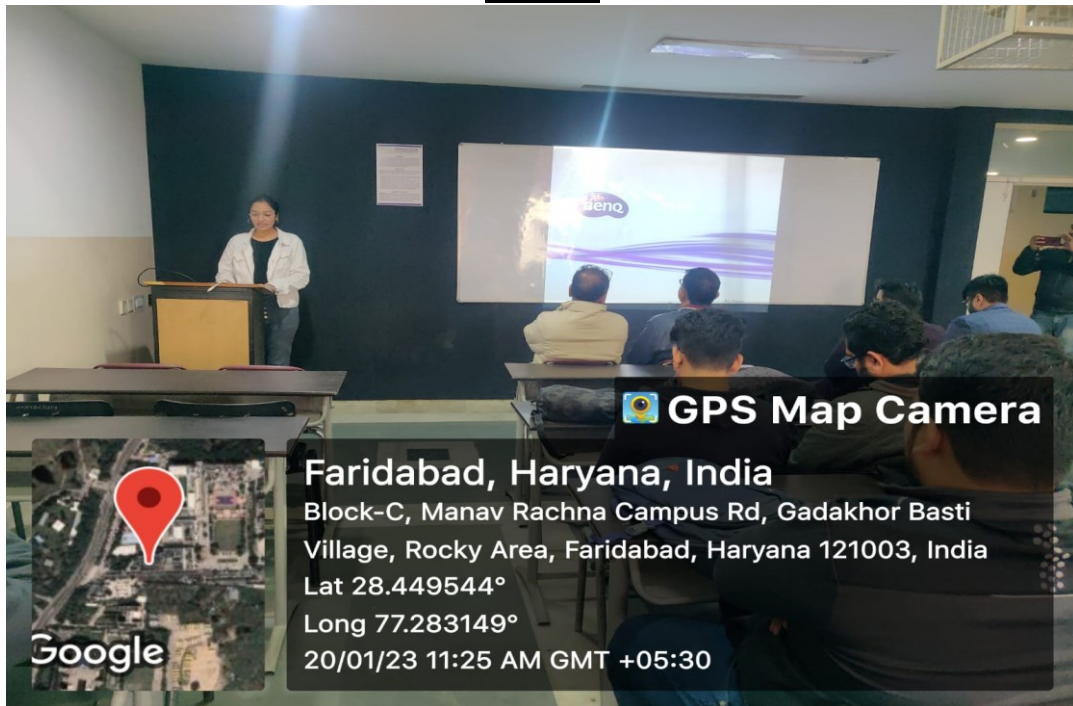
Fig 1: introduction of speakers and event