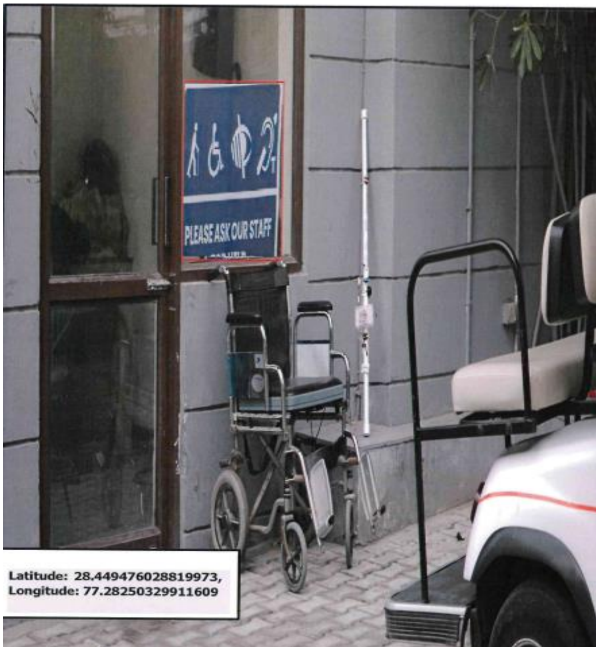
Blind Stick, Wheel Chair available in the office