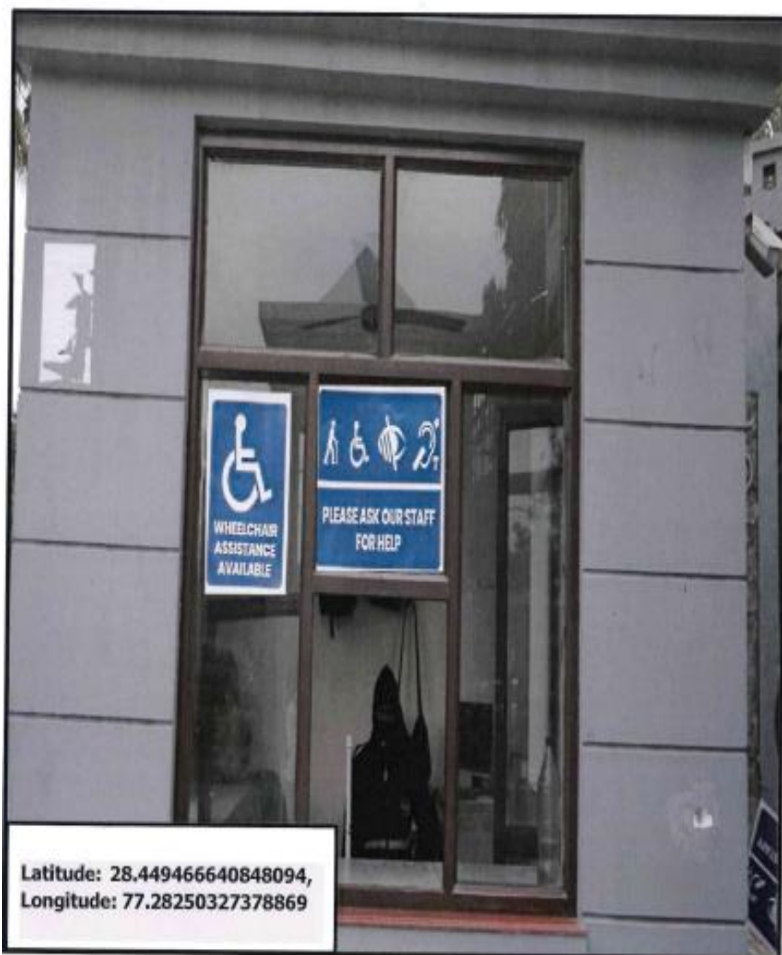
Disability Support Office (with availability of Mechanized Equipments)