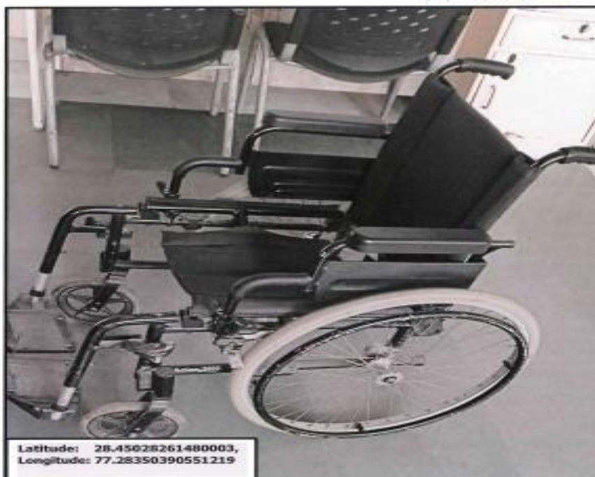
Availability of Wheel chair