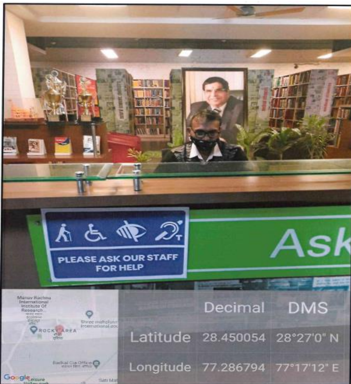
Disability Support office