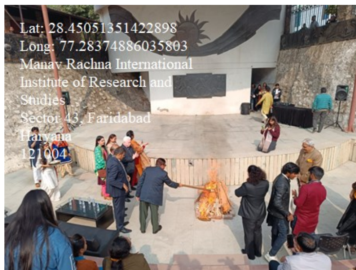
Lohri and Pongal Celebration