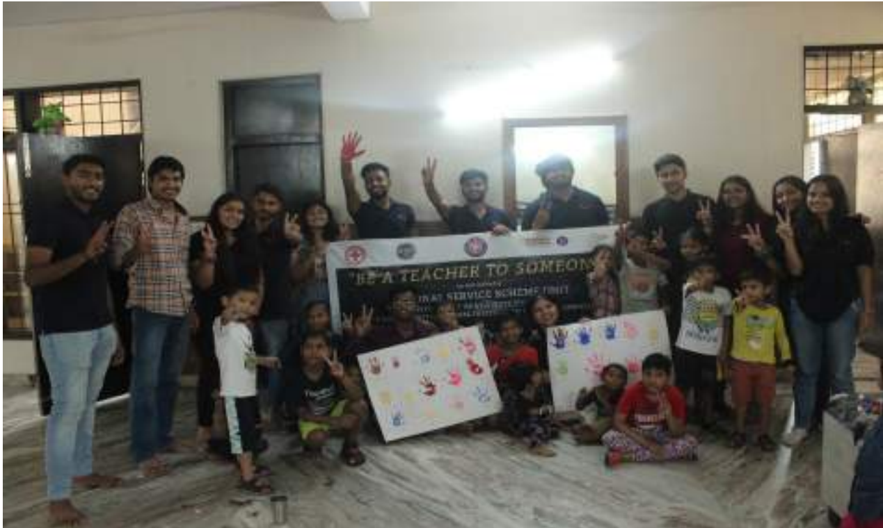
Volunteer students of MRIIRS interacting with kids during visit under "Be a Teacher to Someone" program