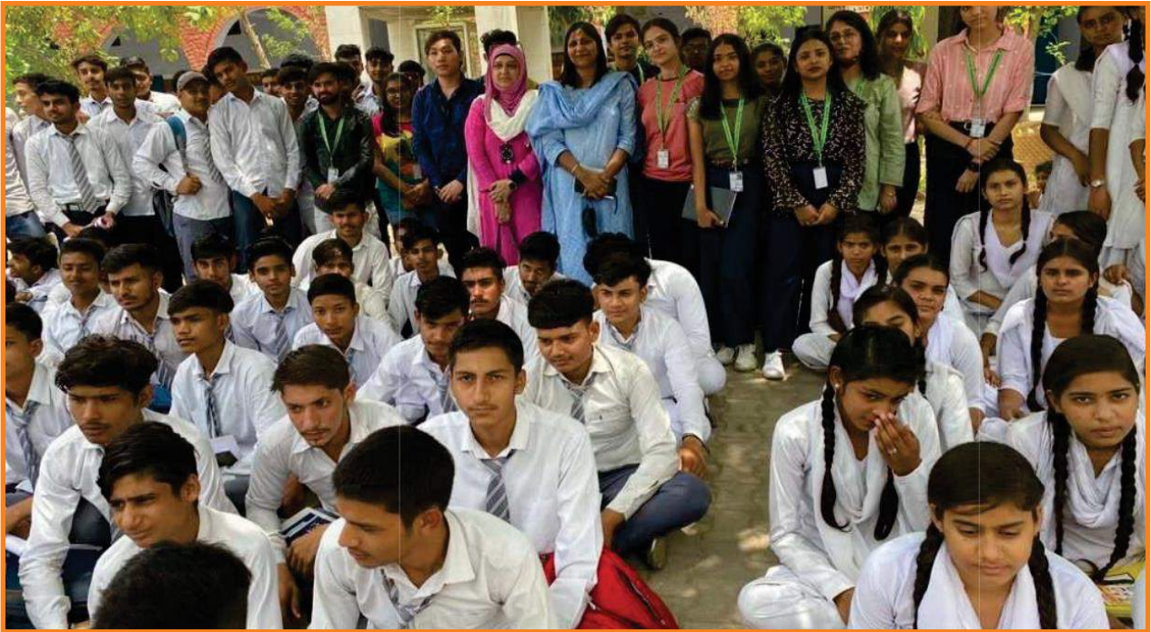
Rural Water Level Protection Plan and Water Literacy