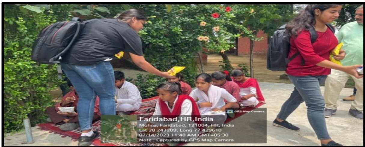
Students and Faculty members visited to different villages to educate village students