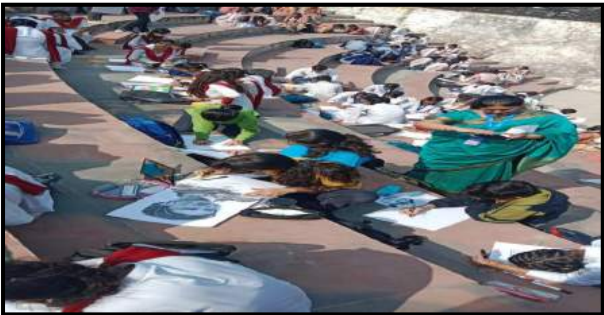
Students participating in ANUBHUTI-22

Media Report: मानव रचना द्वारा आयोजित तकनीकी प्रतियोगिता 'अनुभूति 2022' में 1500 विद्यार्थियों ने लिया भाग | Today Express News Media Report: Anubhuti 2022 organized at MRIIRS