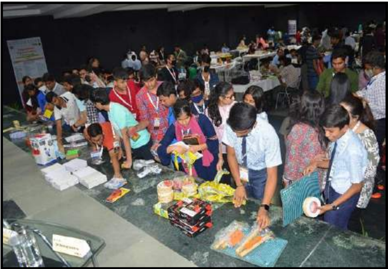
Students Participating in Toycathon 2022

Manav Rachna International Institute of Research and Studies hosted Toycathon 2022 on May 24-25, 2022. This event was a collaborative effort between the Ministry of Education and five other Ministries: the Ministry of Women & Child Development, the Ministry of Information & Broadcasting, the Ministry of Commerce & Industry, the Ministry of Micro, Small and Medium Enterprises, and the Ministry of Textiles. Toycathon aimed to encourage the creation of fresh and inventive toys made from local materials that are cost-effective, safe, environmentally friendly, and of exceptionally high quality, suitable for both Indian and global markets. The event saw participation from 34 teams across India, each bringing innovation and a scientific approach to their toy designs. Seven teams were recognized for their creative concepts, representation of Indian culture, and incorporation of technological advancements. https://manavrachna.edu.in/latest/mriirs-proudly-hosted-the-physical-edition-of-toycathon-2022-as-one-of-the-nodalcentres/