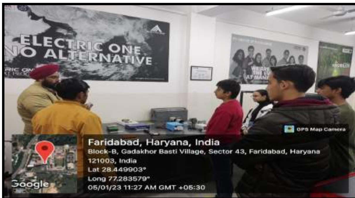
Students attending RUSH program at MRIIRS

Under RUSH Campaign, MRIIRS conducts hands-on training for the school students during which students can use MRIIRS resources and have a practical experience of the numerous tools, equipment and machinery of their interest. In January 2023, many students applied for the RUSH programme in different domains and attended the training in their respective courses at MRIIRS campus