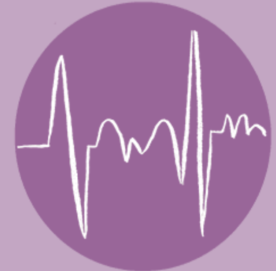
Accelerated heart rate