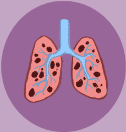
Acute lung damage