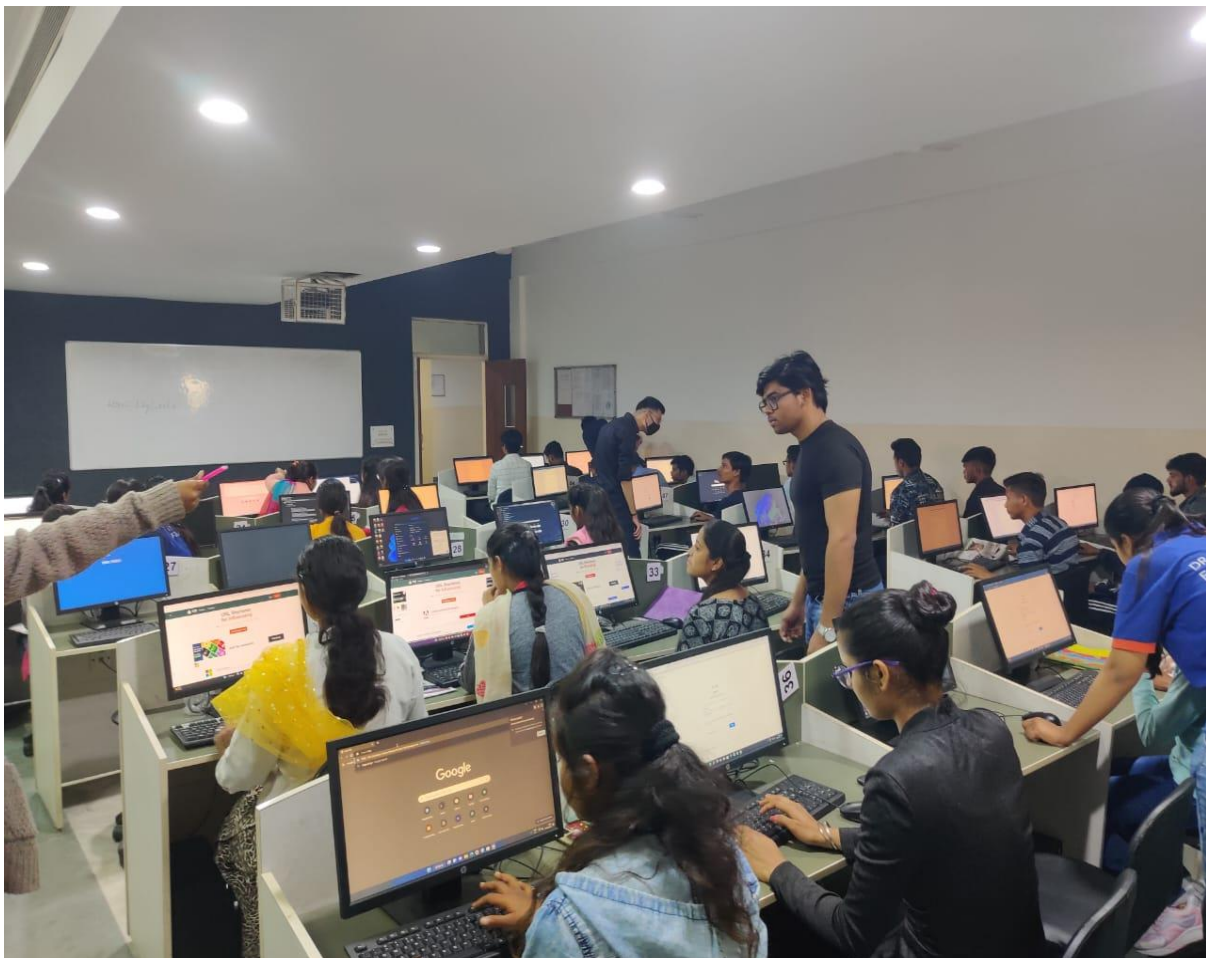
Students attending Computer Classes in MRIIRS Labs