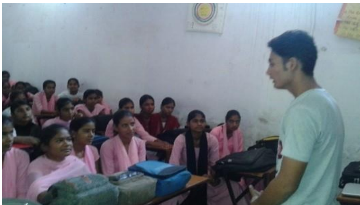
Basics of English Language and Computer Skill Development for Mohna Government Girls School, Mohna